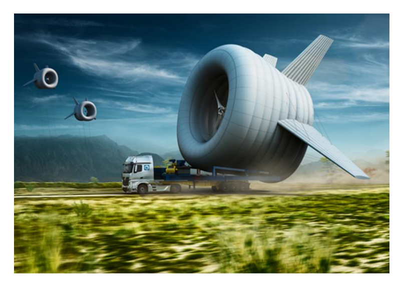
Figure3. Altaeros Energies horizontal buoyant turbine [10]